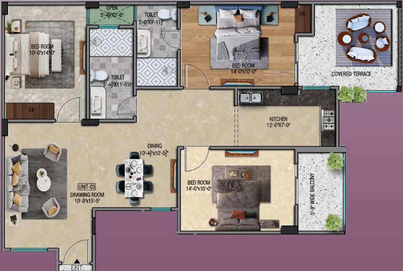
UNIT - 03 ( 3 BHK )