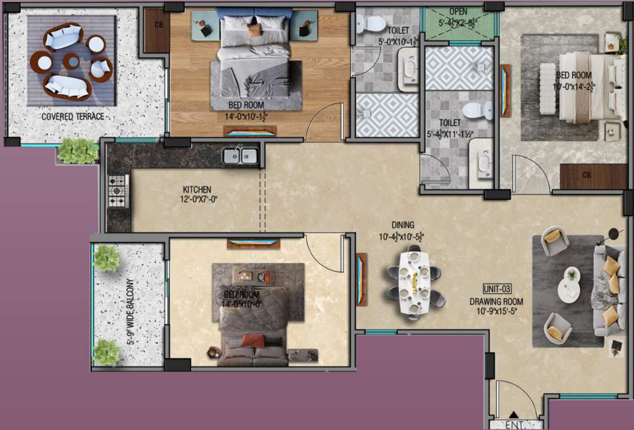
UNIT - 03 ( 3 BHK )