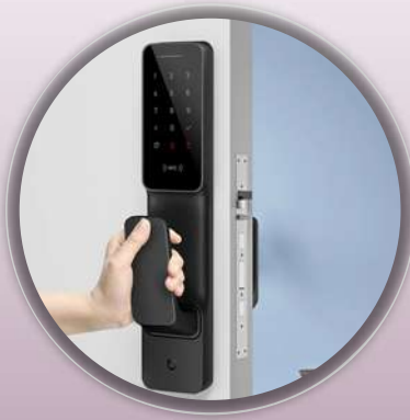
Branded Door Lock