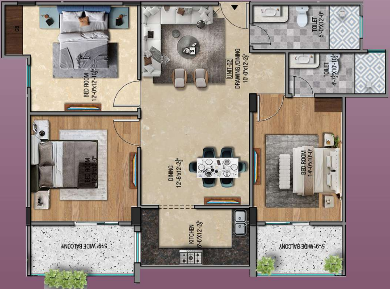
UNIT - 02 ( 3 BHK )