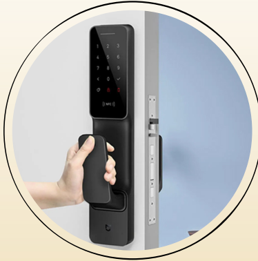
Branded Door Lock