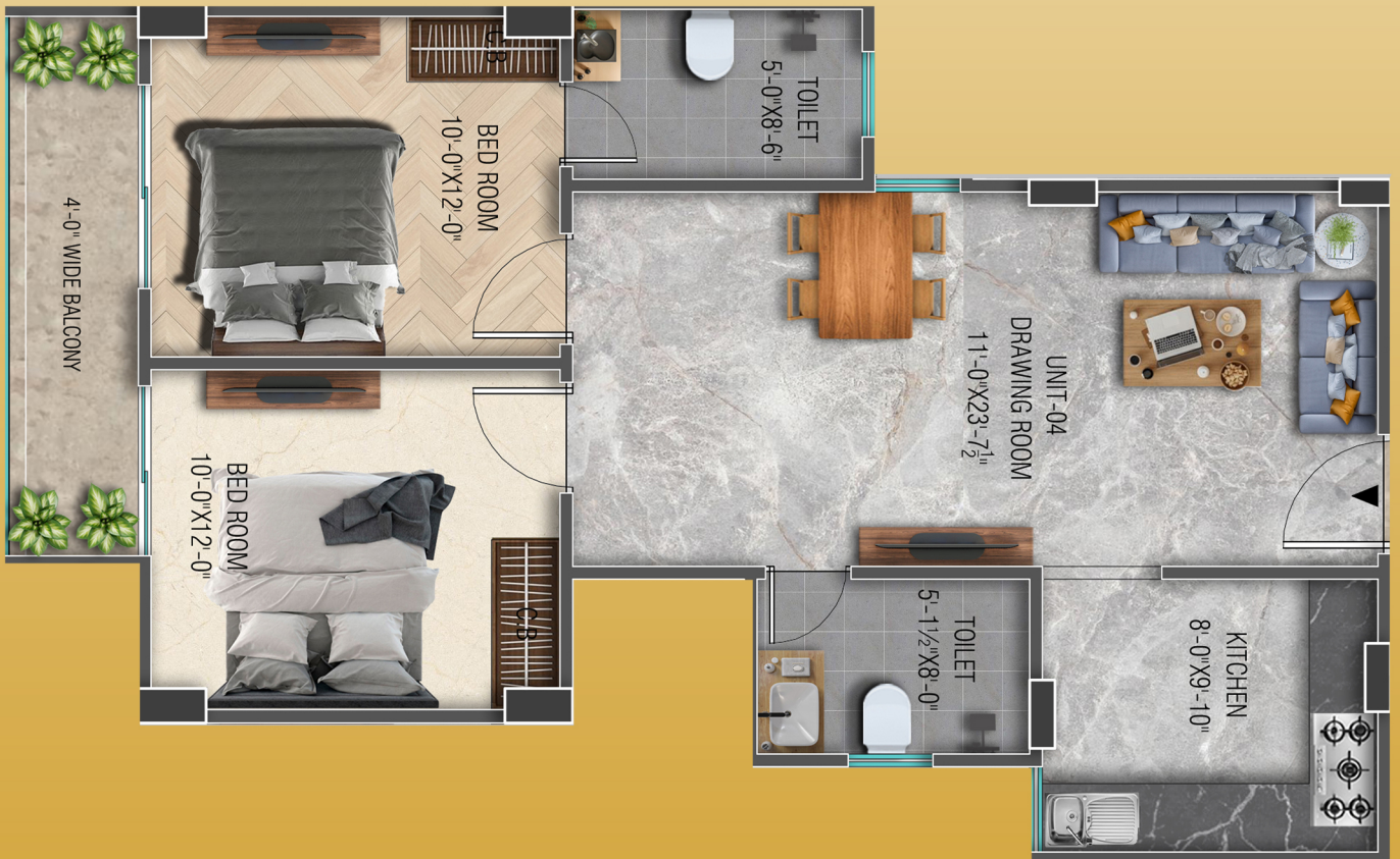
UNIT - 04 ( 2BHK )