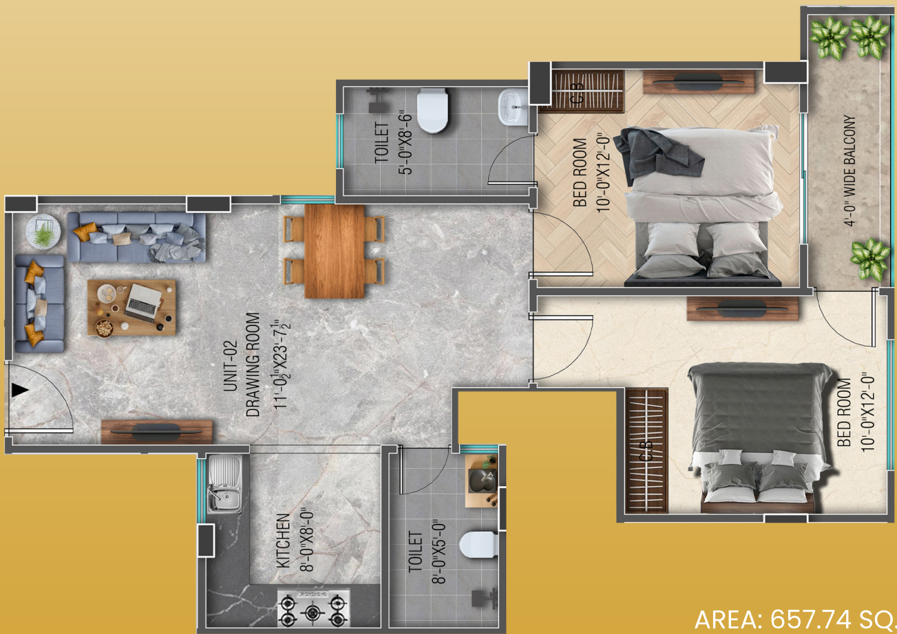
UNIT - 02 ( 2 BHK )