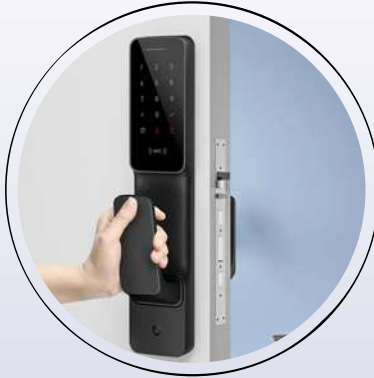
Branded Door Lock