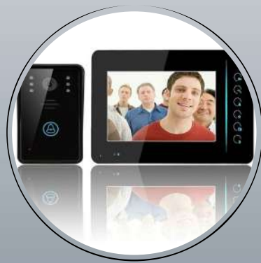
Video Door Bell