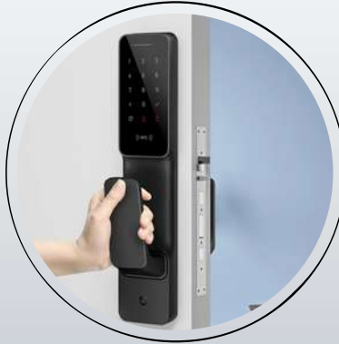
Branded Door Lock